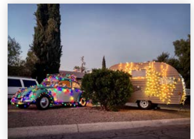
Kristine Peashock, Xmas VW + Trailer, 2020