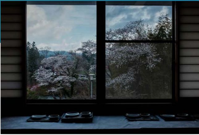
George Nobechi, Breakfast Trays