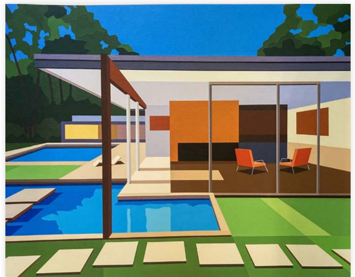
Andy Burgess, Singleton House, 2023, archival pigment print, 24x30 inches