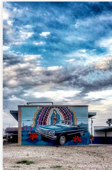
Kristine Peashock, Desert Sud Car Wash, 2019