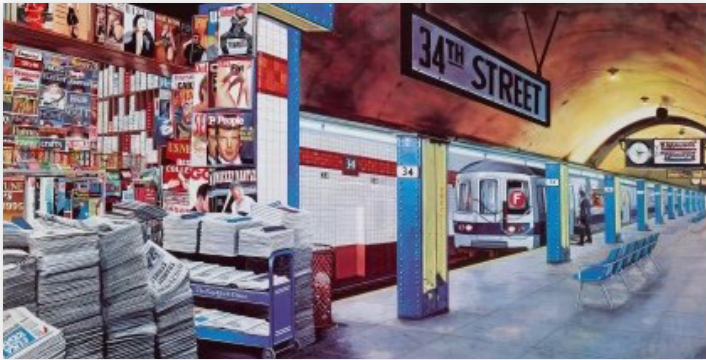
Ken Keeley, 34th Street, ca.1996, 24x46 inches, serigraph