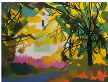
Sheila Miles, Linda Vista Ranch House, 2020-23, TMC Rincon