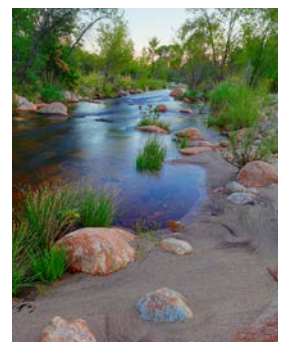
Randy Prentice, Sabino Canyon near Bear Canyon Trail, 2016, TMC Rincon